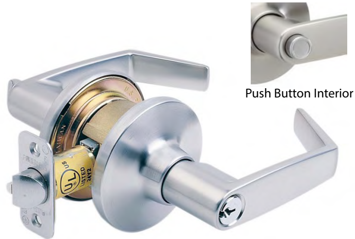
Push Button Interior