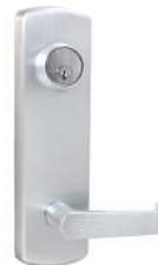
E9300 Escutcheon Lever Trim