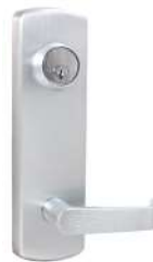
E9300 Escutcheon Lever Trim