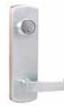
E9000 Electrified Lever Trim