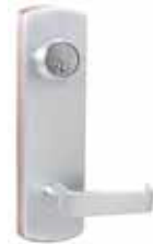
E9000 Electrified Lever Trim