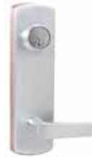
E9000 Escutcheon Lever Trim