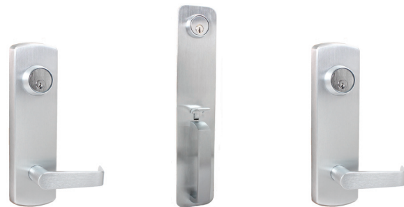
E9000 Escutcheon Lever Trim