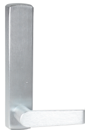
E9100 Escutcheon Lever Trim